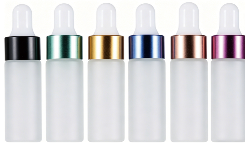
Name : Glass dropper bottle