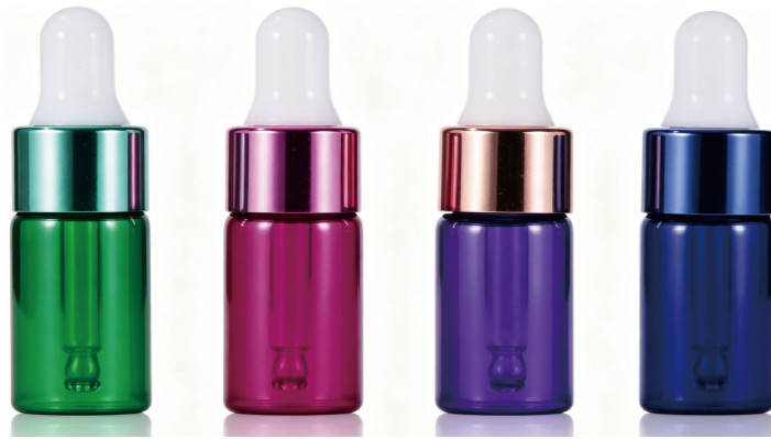
Name: Glass dropper bottle