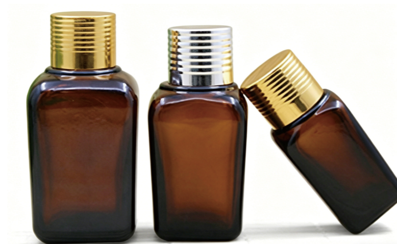
Name: Irregular essential oil bottle