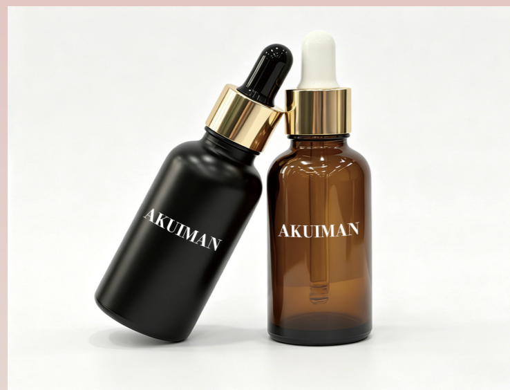
Silk Screen Printing Process