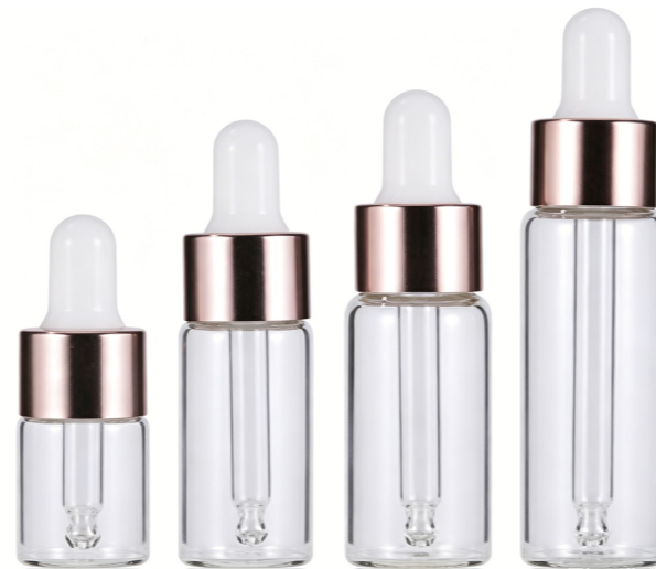
Name: Glass dropper bottle