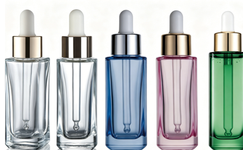
Name : L'Oreal dropper bottle