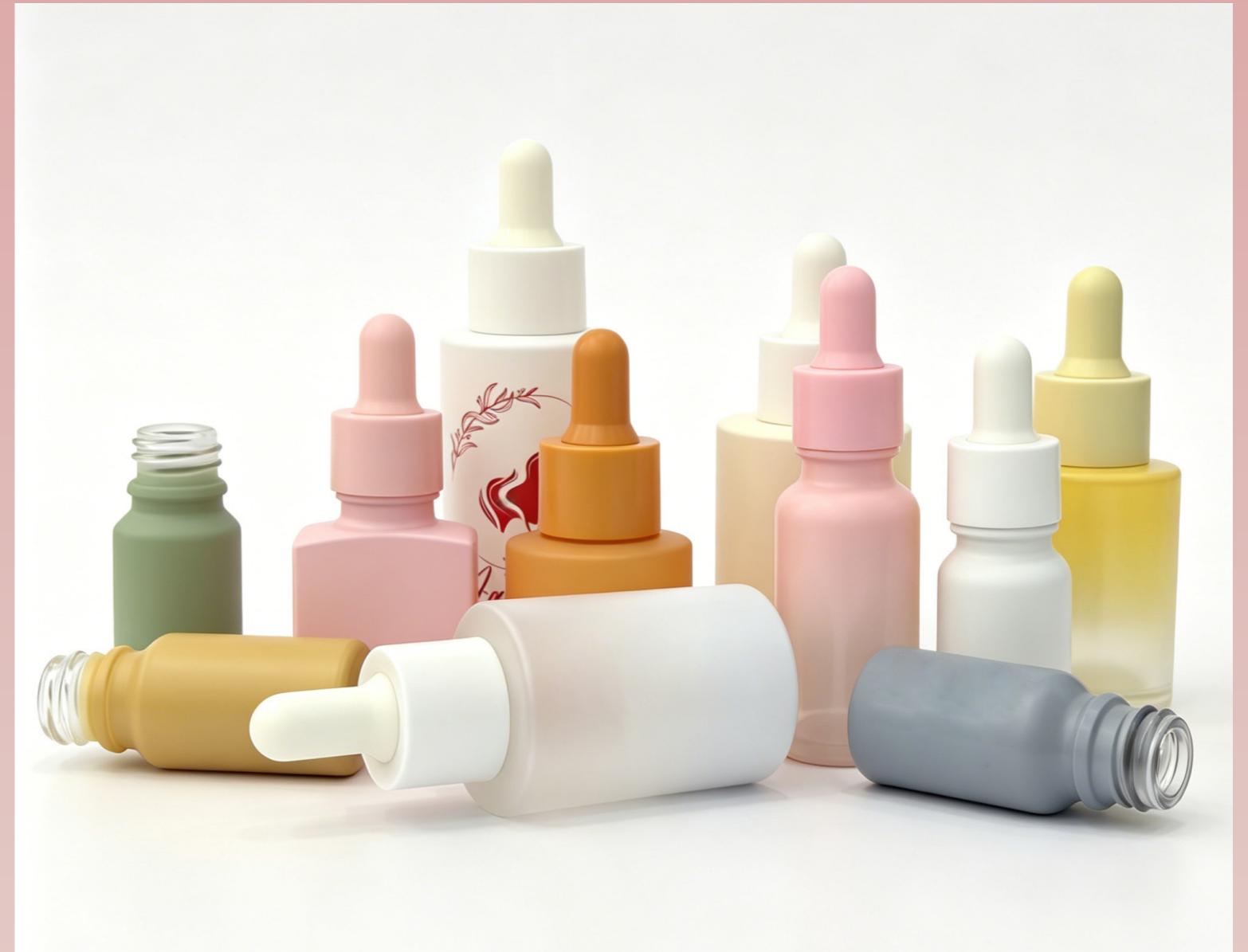
Spray Painting Process