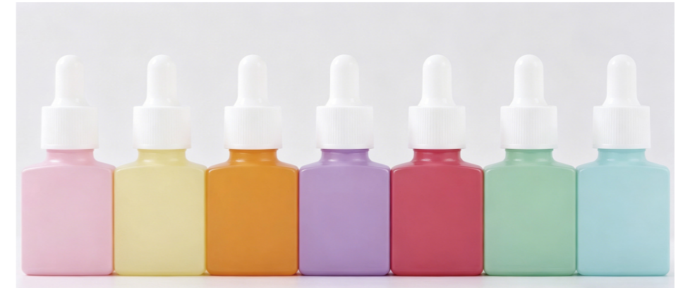
Name: Macaron flat square dropper bottle