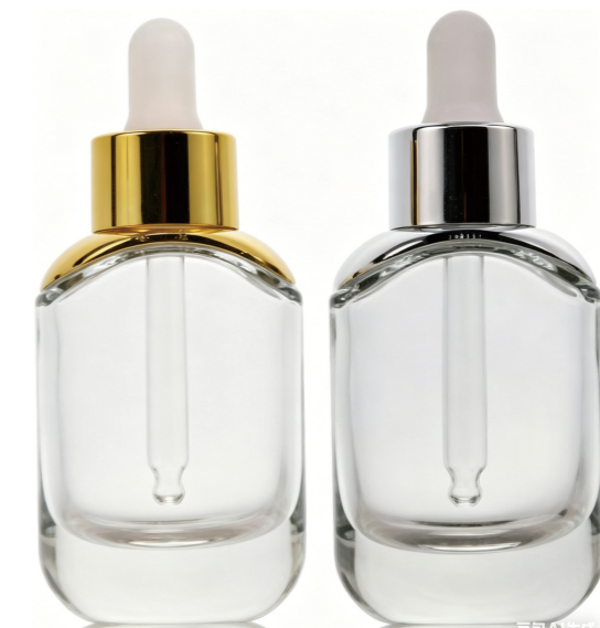
Name: Dior dropper bottle