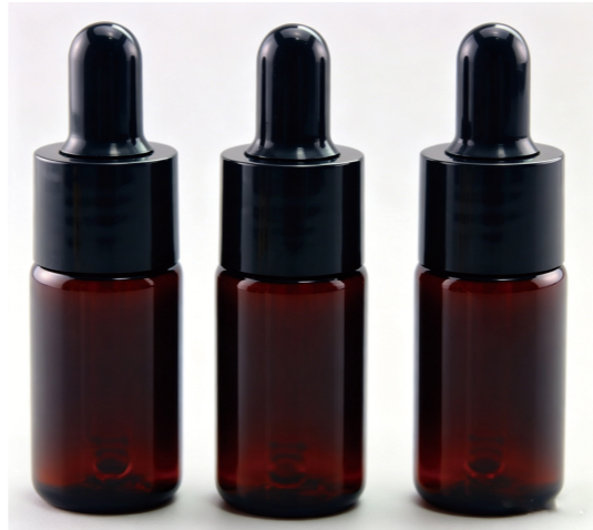
Name: Plastic dropper bottle

Color: Green,purple,blue,rose red bottle