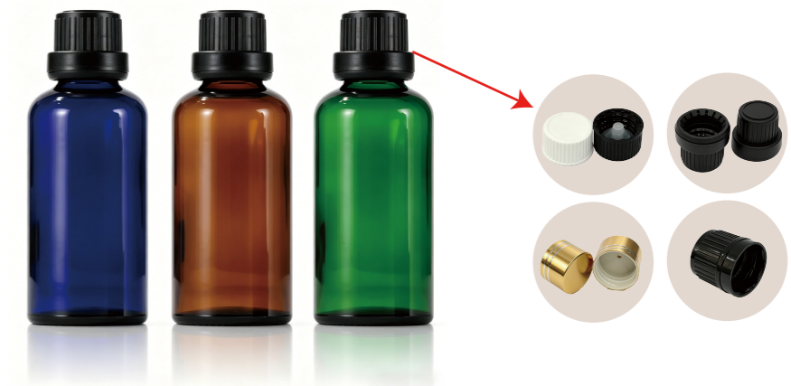
Name: Ordinary essential oil bottle