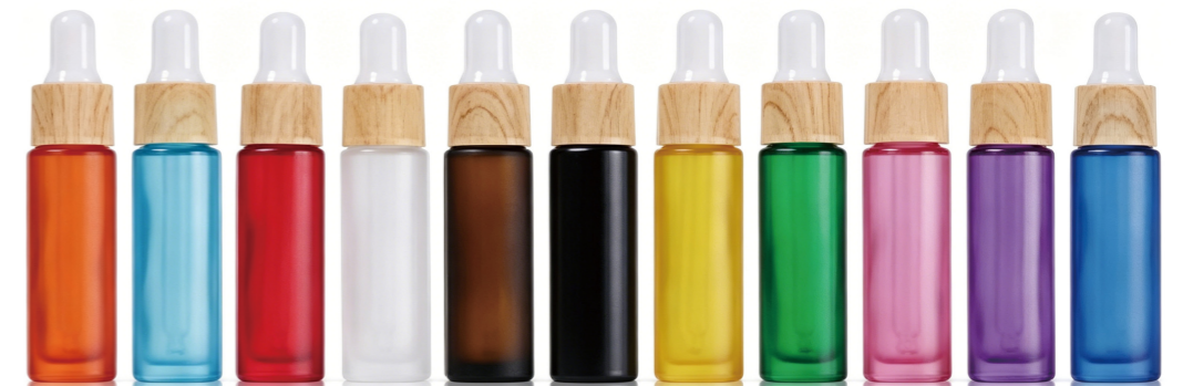
Name: Glass dropper bottle