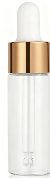
Name: Macaron flat square dropper bottle