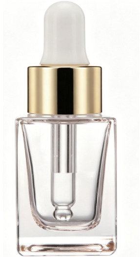
Name: 15ml square dropper bottle