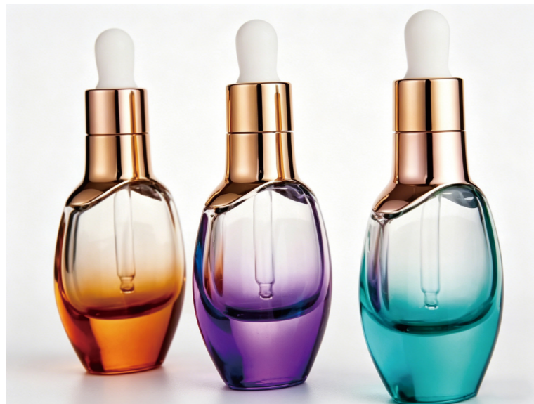
Name: La Mer dropper bottle