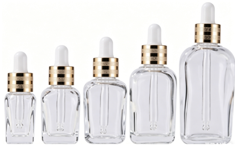
Name: Glass dropper bottle