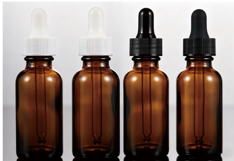
Name: Boston dropper bottle

Color : pink,yellow,orange,purple,red,green,blue