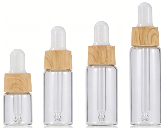
Name: Glass dropper bottle