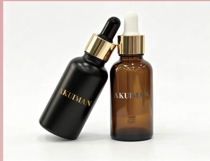
Hot Stamping Process