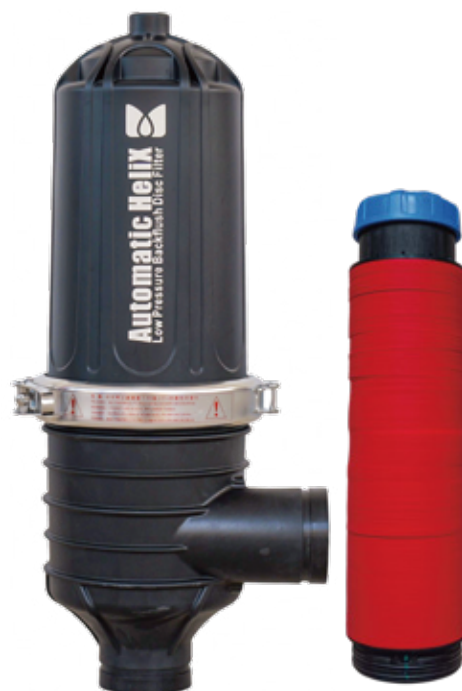
3" VIC Grooved