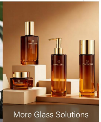
More Glass Solutions