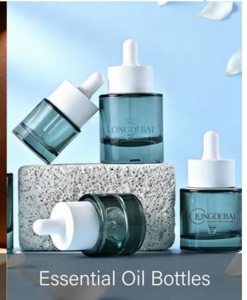
Essential Oil Bottles