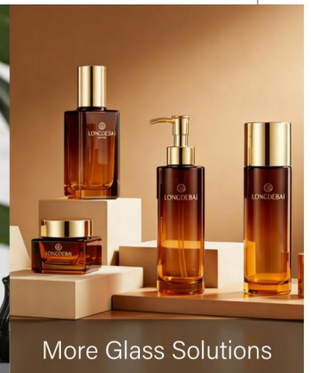
More Glass Solutions