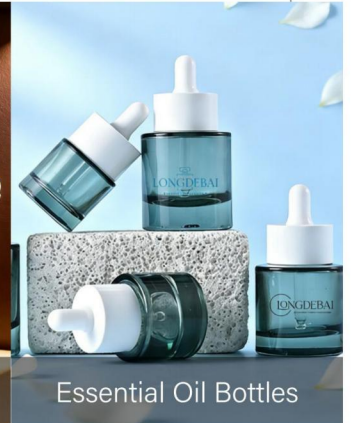
Essential Oil Bottles