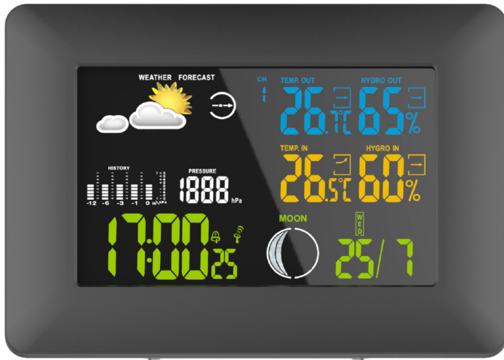
Weather station receiver