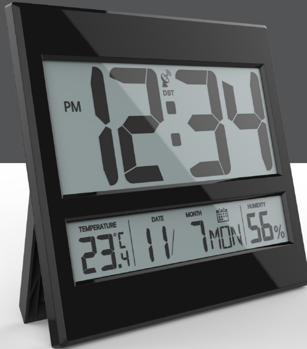
RC Clock with temperature & humidity