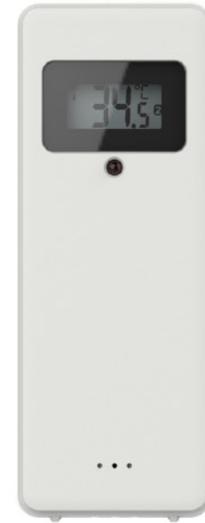
RC Clock with In/Outdoor temperature