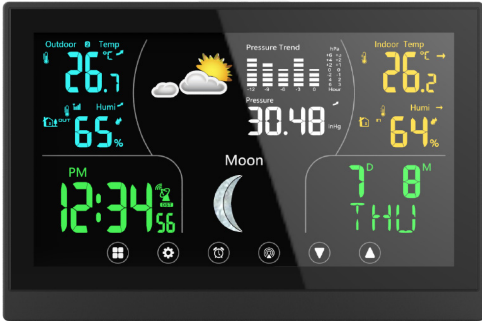
Weather station receiver