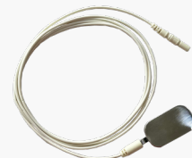
Body ground cable ( DIN interface )