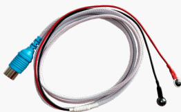
Cup record cable