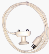
Saddle electrode ( Bar type)