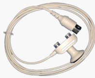
Saddle electrode ( Felt type)