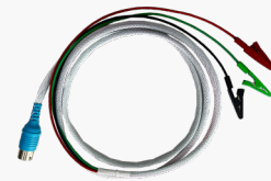
Clip electrode with body ground cable