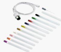
Concentric needle electrode & connecting cable