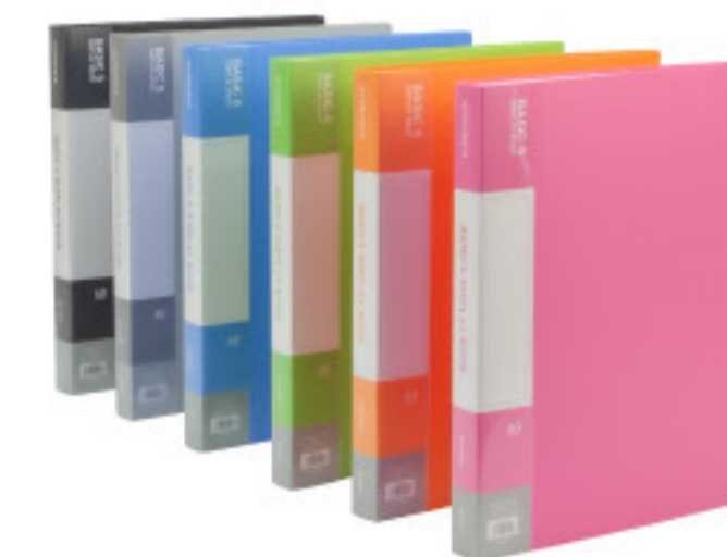
F20 / 30 / 40 AK-BS