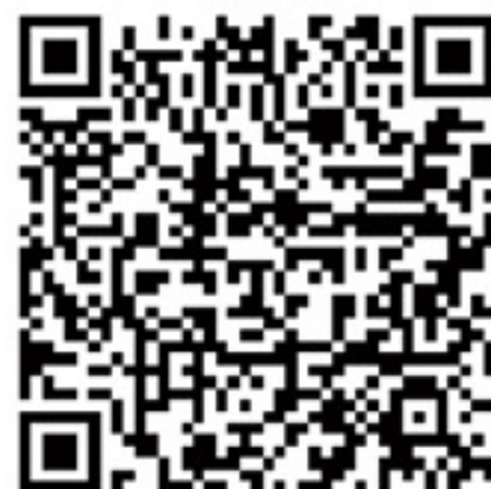
Alibaba Store Huirong

Manufacturer: Nanjing Huirong Household Technology Co., Ltd.