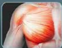
Muscles after exercise (Lactic acid accumulation)