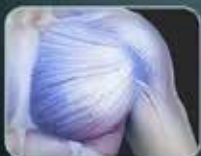
After using massage gun (Lactic acid decomposition)