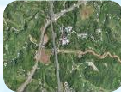
survey and draw