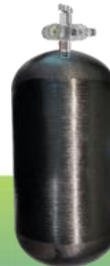
3 kW hydrogen powered battery