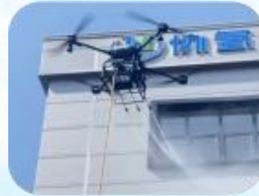
Curtain wall cleaning