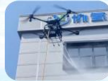
Curtain wall cleaning