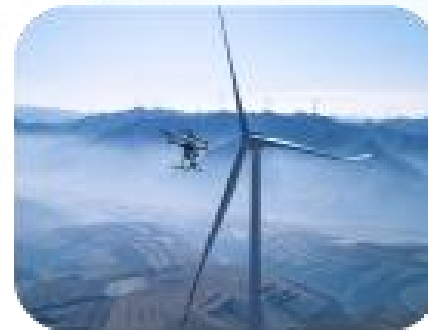
Wind power generation inspection