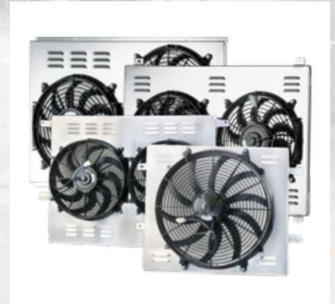
Shroud & Fan