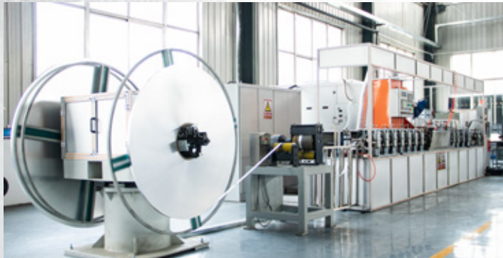
Tube Making Machine