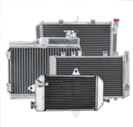
All-aluminium Motorbike Radiator