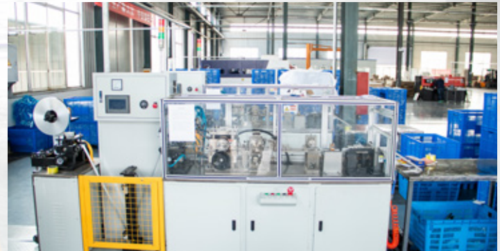
Rolling Belt Machine