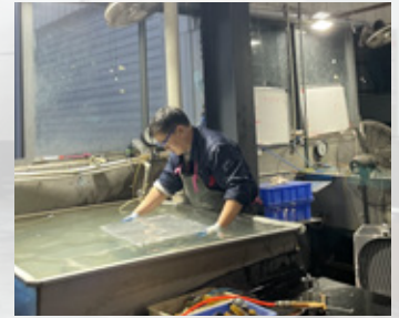
Air Tightness Testing