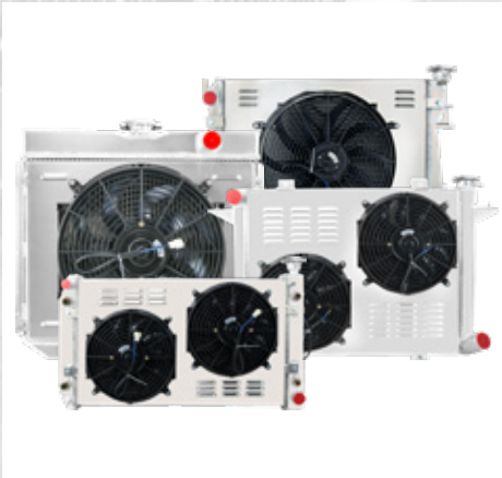
All-aluminium Auto Radiator

·Strength Factory ·Support Customisation ·Wholesale Price