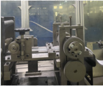
Aluminium Strip Fabrication