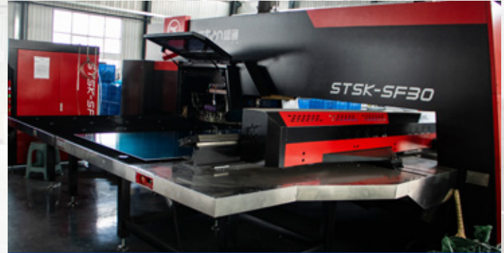
CNC Turret Punch Press