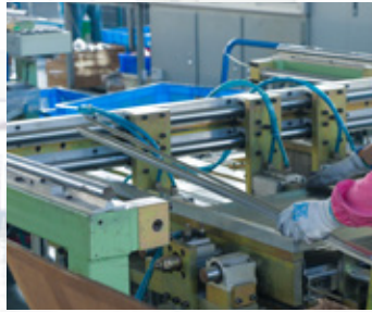
Radiator Core Assembly