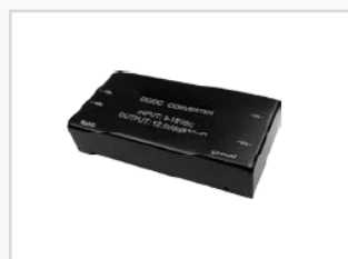
POL Power Supply