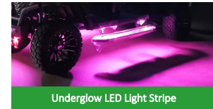
Underglow LED Light Stripe