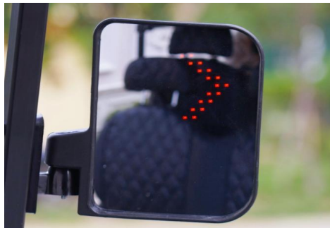
Side Mirror with LED Turn Signal