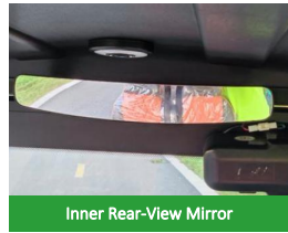
Inner Rear-View Mirror