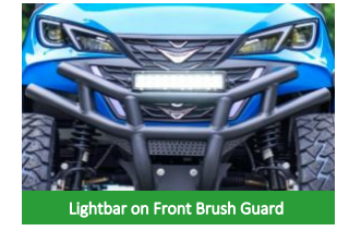
Lightbar on Front Brush Guard