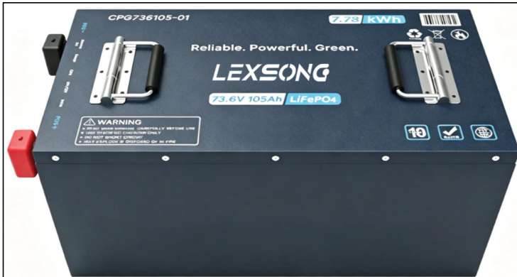
Lithium Iron Phosphate (LFP) Battery