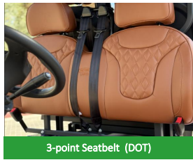
3-point Seatbelt (DOT)