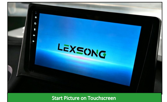
Start Picture on Touchscreen

Other customizations are available, please check with us for details