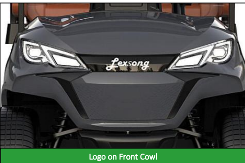
Logo on Front Cowl