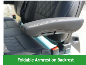
Foldable Armrest on Backrest