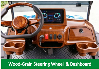
Wood-Grain Steering Wheel & Dashboard