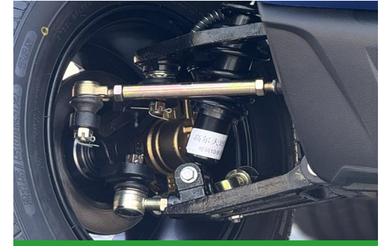
Front Double Wish-bone Independent Suspension