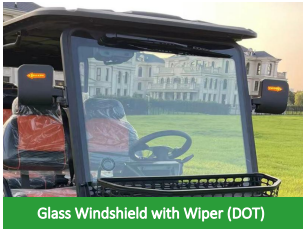
Glass Windshield with Wiper (DOT)