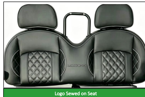
Logo Sewed on Seat