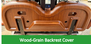
Wood-Grain Backrest Cover