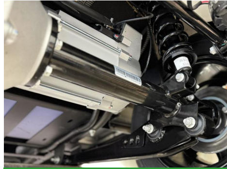
Rear Trailing Arm Suspension with Shock Absorber