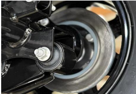
4-Wheel Hydraulic Disc Brake