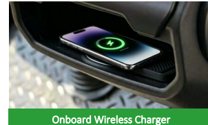
Onboard Wireless Charger