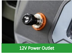
12V Power Outlet