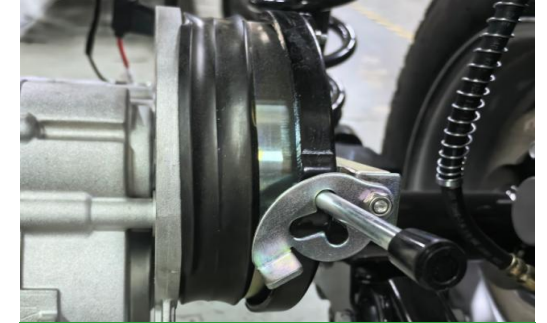
Electromagnetic Parking Brake