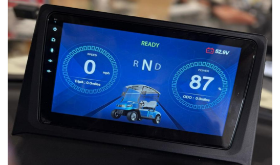
10.1" Inch Multi-function Touchscreen Display