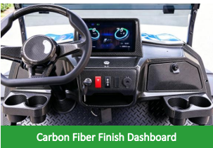
Carbon Fiber Finish Dashboard