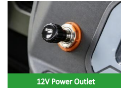
12V Power Outlet