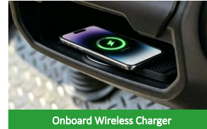
Onboard Wireless Charger