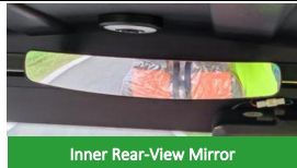
Inner Rear-View Mirror