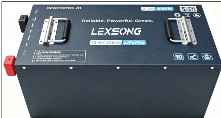
Lithium Iron Phosphate (LFP) Battery