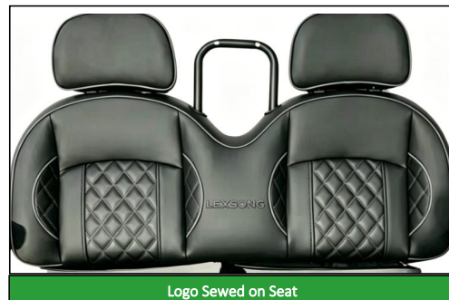
Logo Sewed on Seat