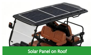
Solar Panel on Roof