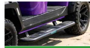
Side Foot Step