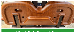
Wood-Grain Backrest Cover