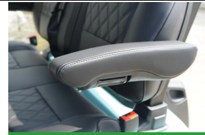
Foldable Armrest on Backrest