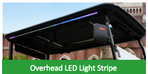
Overhead LED Light Stripe