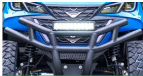
Lightbar on Front Brush Guard