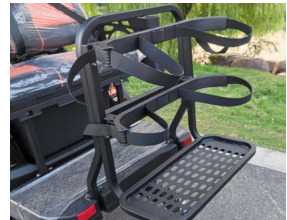
Golf Bag Holder