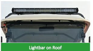
Lightbar on Roof