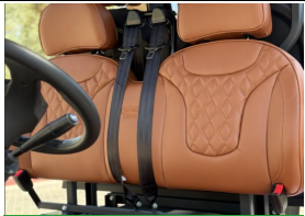
3-point Seatbelt (DOT)