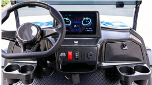
Carbon Fiber Finish Dashboard