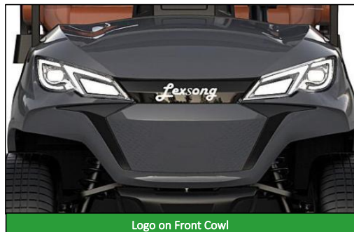
Logo on Front Cowl