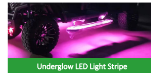
Underglow LED Light Stripe