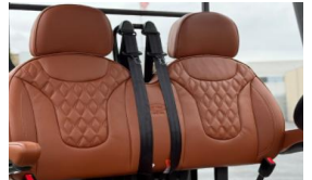
Backrest with Headrest