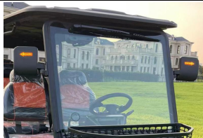
Glass Windshield with Wiper (DOT)