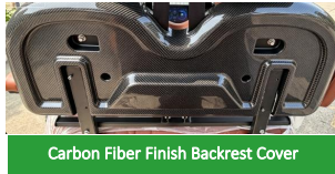
Carbon Fiber Finish Backrest Cover