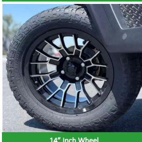
14" Inch Wheel