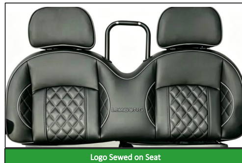
Logo Sewed on Seat