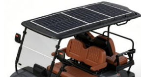
Solar Panel on Roof