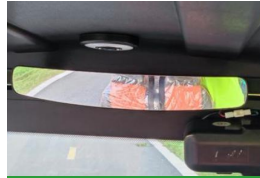
Inner Rear-View Mirror