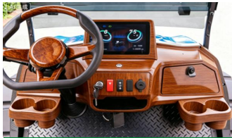
Wood-Grain Steering Wheel & Dashboard