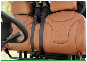
3-point Seatbelt (DOT)