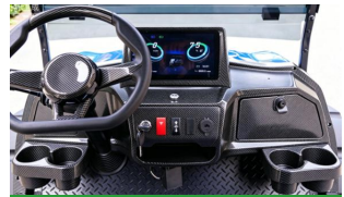
Carbon Fiber Finish Dashboard