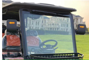
Glass Windshield with Wiper (DOT)