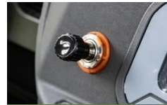
12V Power Outlet