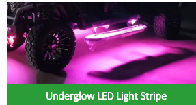
Underglow LED Light Stripe