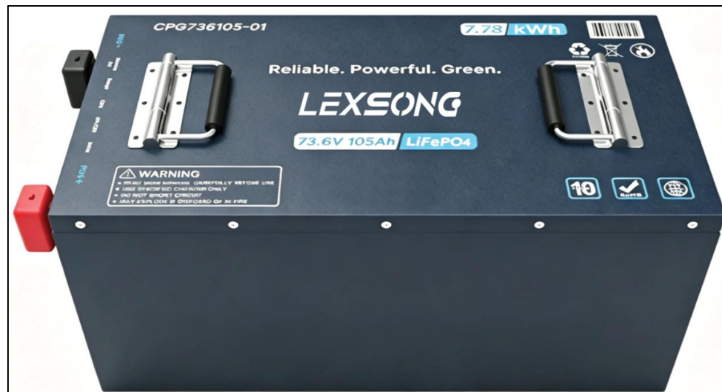
Lithium Iron Phosphate (LFP) Battery