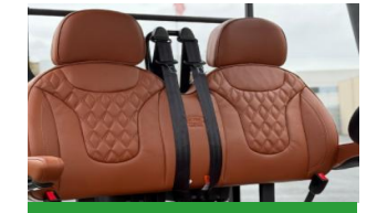
Backrest with Headrest