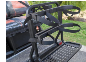
Golf Bag Holder