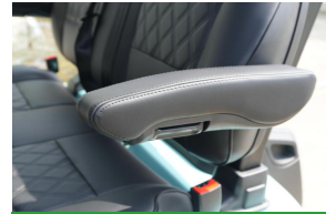
Foldable Armrest on Backrest