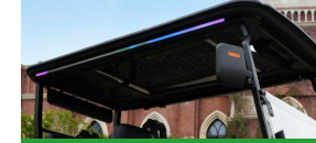
Overhead LED Light Stripe