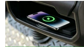
Onboard Wireless Charger