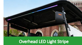
Overhead LED Light Stripe