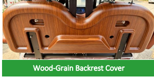
Wood-Grain Backrest Cover