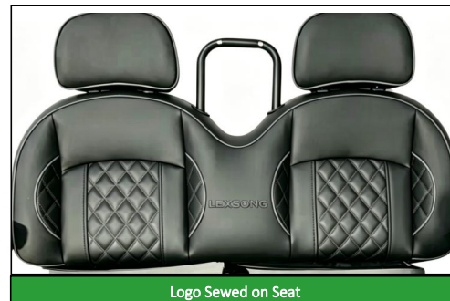
Logo Sewed on Seat