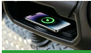
Onboard Wireless Charger