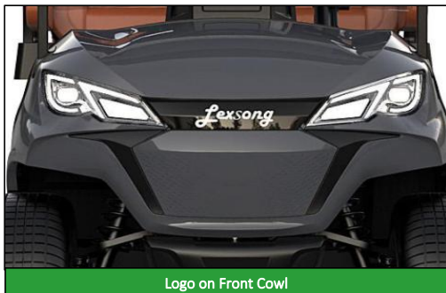
Logo on Front Cowl