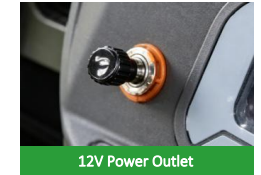
12V Power Outlet