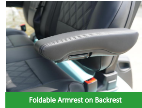
Foldable Armrest on Backrest