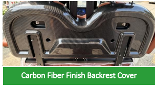
Carbon Fiber Finish Backrest Cover