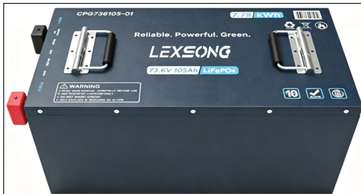
Lithium Iron Phosphate (LFP) Battery