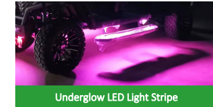
Underglow LED Light Stripe