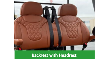
Backrest with Headrest