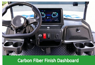
Carbon Fiber Finish Dashboard