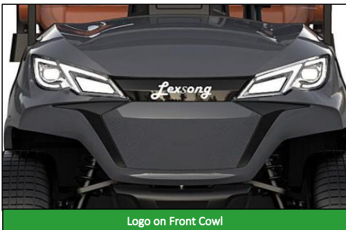
Logo on Front Cowl