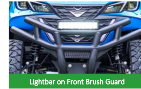
Lightbar on Front Brush Guard