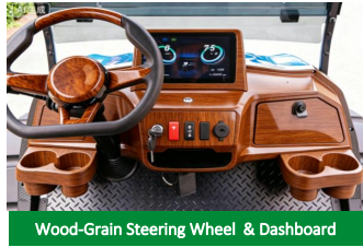
Wood-Grain Steering Wheel & Dashboard