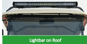
Lightbar on Roof