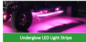
Underglow LED Light Stripe