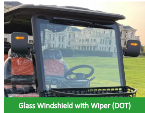
Glass Windshield with Wiper (DOT)