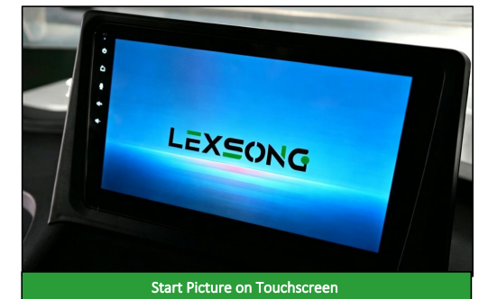
Start Picture on Touchscreen

Other customizations are available, please check with us for details