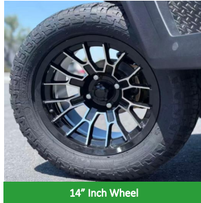
14" Inch Wheel