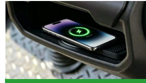
Onboard Wireless Charger