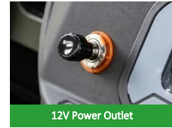
12V Power Outlet