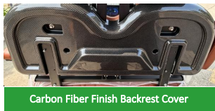
Carbon Fiber Finish Backrest Cover