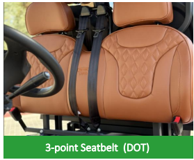
3-point Seatbelt (DOT)