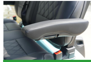
Foldable Armrest on Backrest