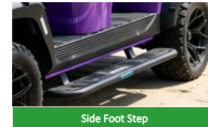
Side Foot Step