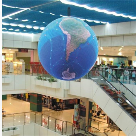
Shopping mall decoration