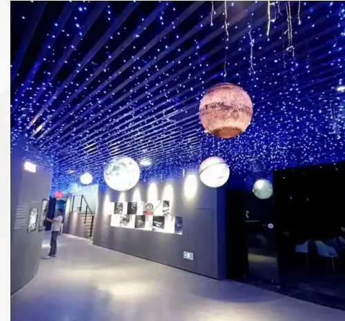
Exhibition hall decoration