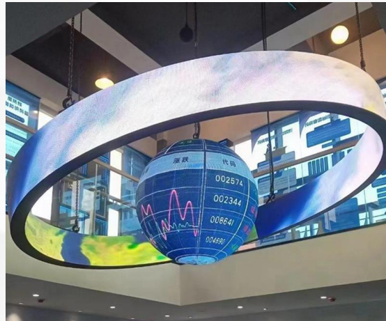
Exhibition hall decoration