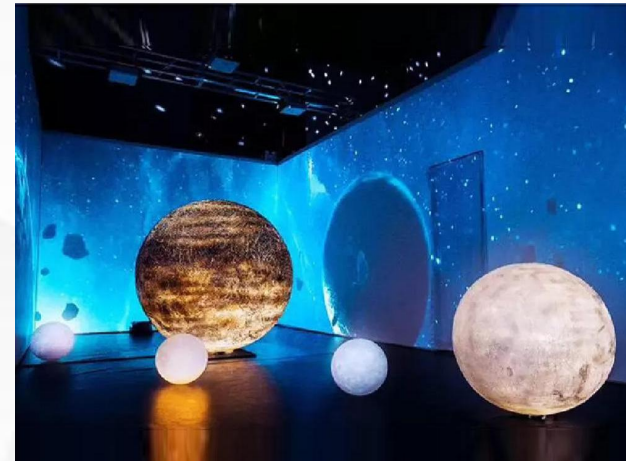
Exhibition hall decoration