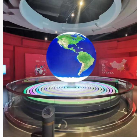
Exhibition hall decoration