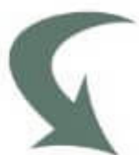
拉丝 Fiber Making