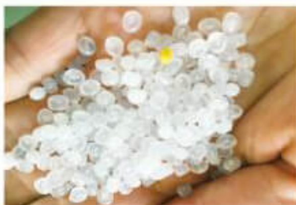
原料 Raw Material