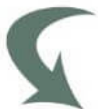
拉丝 Fiber Making