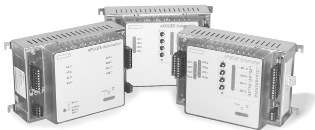
Figure 1. Point Expansion Modules.