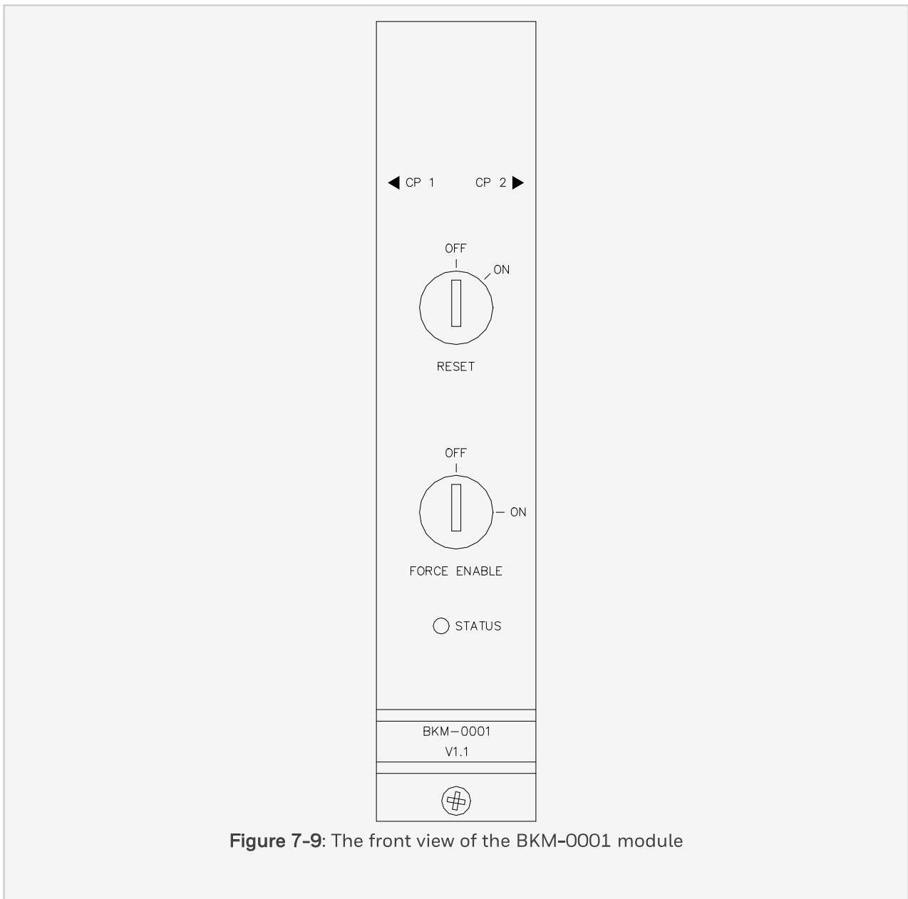
Figure 7-9: The front view of the BKM-0001 module

The BKM-0001 module may be placed or removed in a running system. The application program will not be interrupted by these actions.