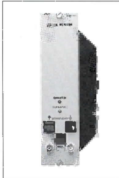
3300/01 System Monitor

The System Monitor controls the system OK function. This OK indicates the correct operation of the system and associated transducers and field wiring. The System Monitor drives the system OK relay, which is located on the Power Input Module (at the rear of the Power Supply). Since the system OK relay is normally energized, it also can be used to annunciate loss of primary power to the 3300 rack. Because of these benefits, we strongly recommend connection of