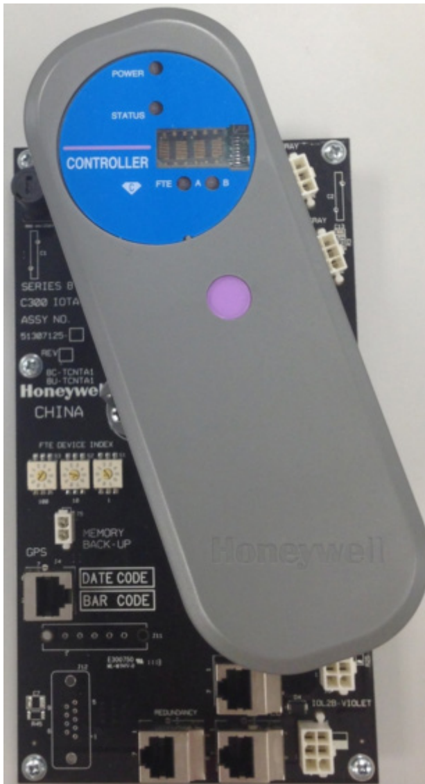
Figure 3.1 Series 8 form factor example

For more details about Series 8 I/O, Level1 Switch and FIM modules refer to the following documents: