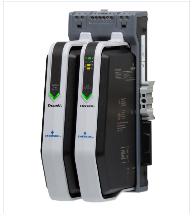
The SX Controller.

Field Proven Architecture. The SX Controller is an evolution of the DeltaV MX Controller. The new design delivers installation and robustness enhancement while still using the same processor and OS that has proven itself in the field. All IO cards run the latest software enhancements of corresponding M-series IO cards and deliver the same field proven, reliable operation.