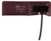
Article Number: RCNST0814