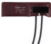
Article Number: RCNDT0814