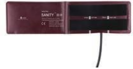
Article Number: RCNST2635