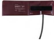
Article Number: RCNST1320