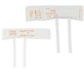
Article Number: N1DT