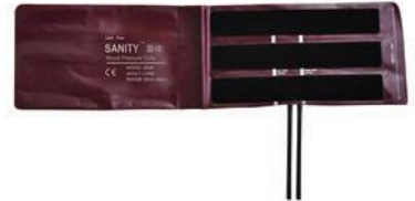
Article Number: RCNDT4250