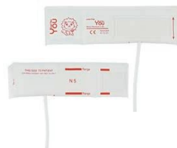
Article Number: N5ST