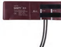
Article Number: RCNDT1826