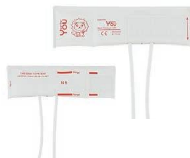
Article Number: N5DT