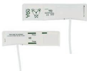
Article Number: N3ST