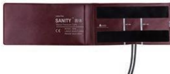
Article Number: RCNDT3544