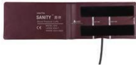
Article Number: RCNST3242