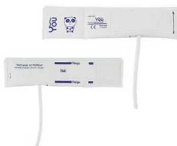
Article Number: N4ST