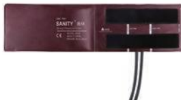
Article Number: RCNDT2938