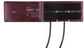
Article Number: RCNDT2635