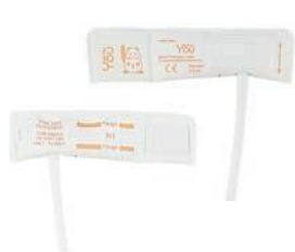
Article Number: N1ST