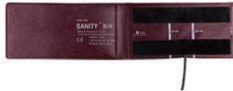
Article Number: RCNST3544