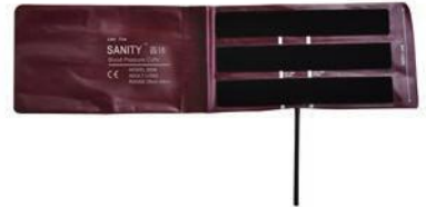
Article Number: RCNST4250