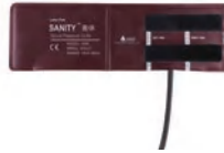
Article Number: RCNST1826