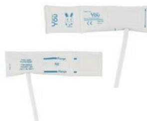
Article Number: N2ST