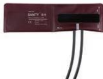
Article Number: RCNDT1320