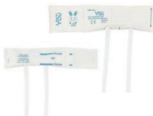
Article Number: N2DT