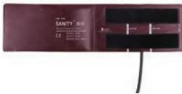
Article Number: RCNST2938