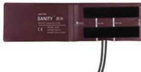
Article Number: RCNDT3242