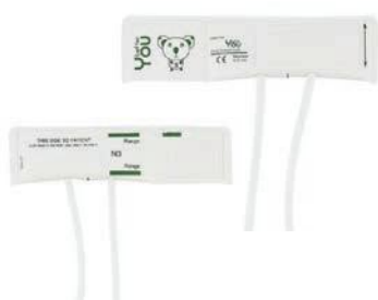
Article Number: N3DT