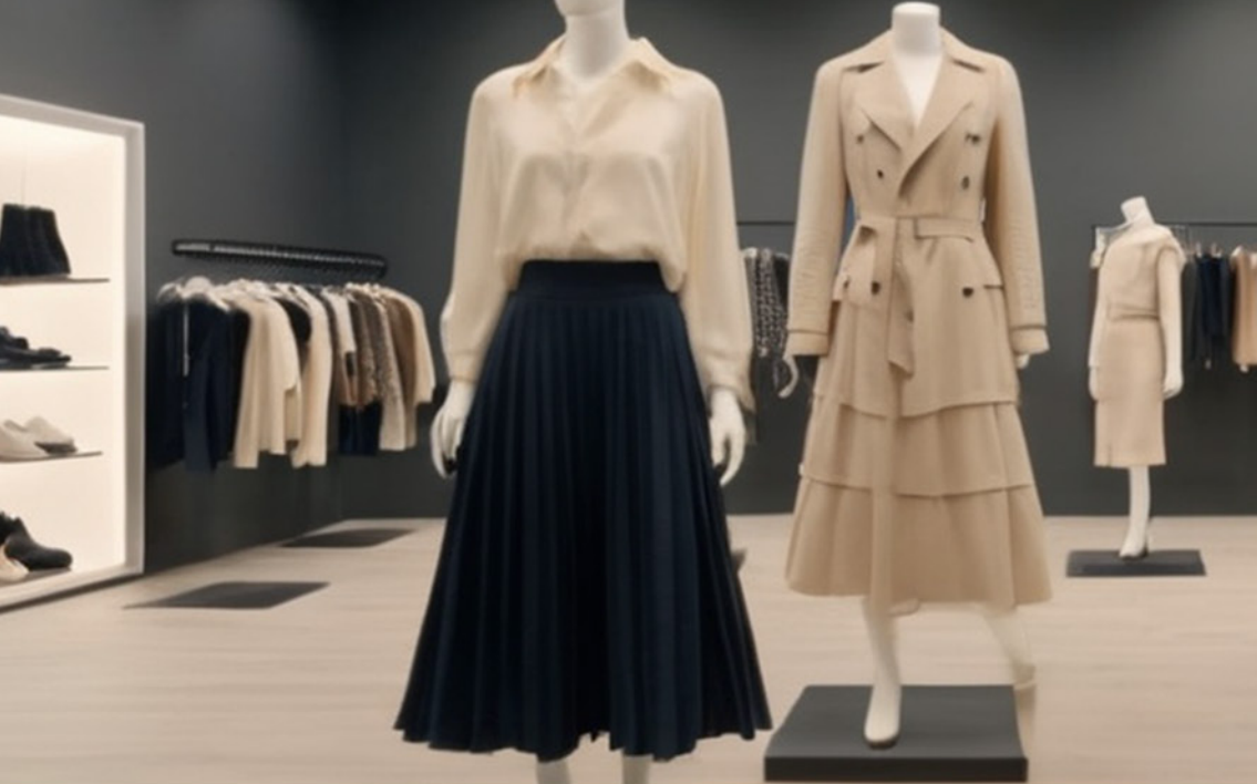
YGQ001 Fabric code: RC-8213 Fabric: 70%Cotton 27%Nylon 3%Spandex