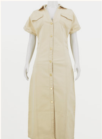
YGQ002 Fabric code: MJ-HT133-3B Fabric: 65%cotton 30%Polyester 4%Viscose 1%Spandex