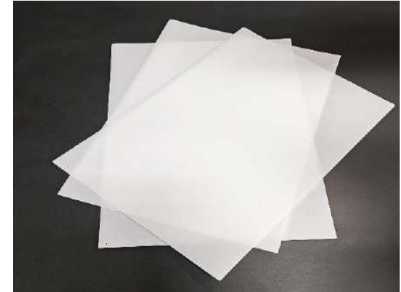
描图纸/热胶/白色格拉辛纸 TRACING PAPER WHITE GLASSINE PAPER LINER HOT MELT ADHESIVE