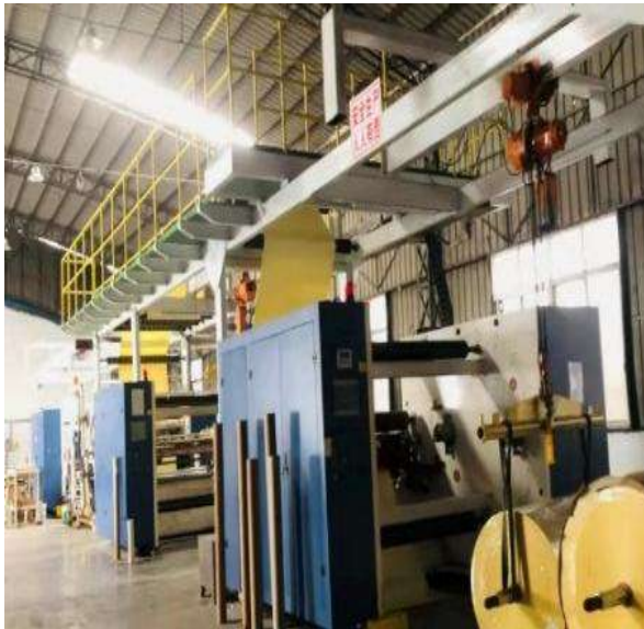
热熔胶涂布机1600 Hot Melt PSA Coating Machine