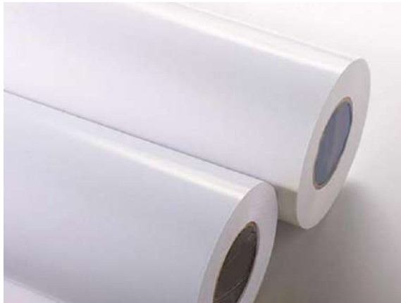
玻卡纸/热胶/白色防粘纸 GLOSSY CAST COATED PAPER WHITE RELEASE PAPER HOT MELT ADHESIVE