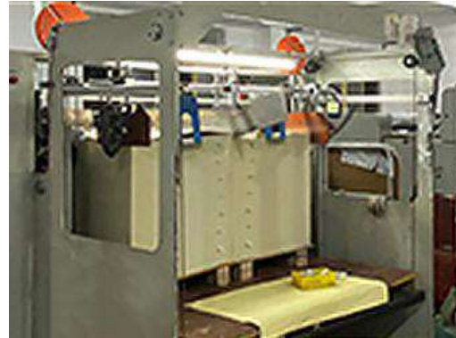
切张 Cutting to sheets