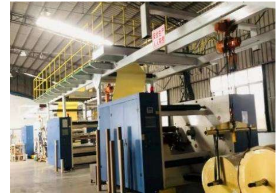
涂胶 Glue Coated