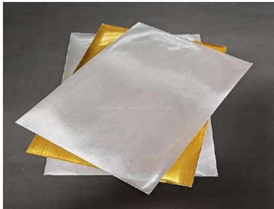
50μm拉丝银/水胶/白色防粘纸 50μm DRAWBENCH SILVER PET WHITE RELEASE PAPER ARCYLIC ADHESIVE