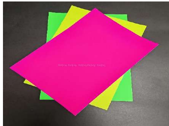
荧光纸/水胶/白色防粘纸 TRACING PAPER WHITE RELEASE PAPER ARCYLIC ADHESIVE