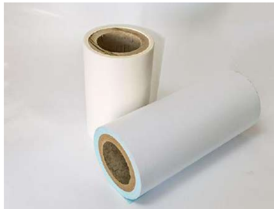
热敏纸/热胶/格拉辛纸 THERMAL PAPER GLASSINE PAPER LINER HOT MELT ADHESIVE