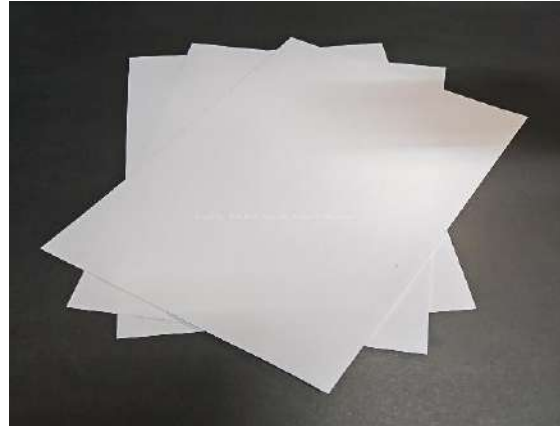
书写纸FSC/可移胶/白色防粘纸FSC WOODENFREE PAPER(FSC) WHITE RELEASE PAPER(FSC) HOT MELT ADHESIVE(REMOVABLE)