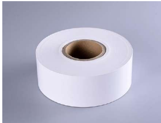
书写纸/水胶/白色格拉辛纸 WOODENFREE PAPER WHITE GLASSINE PAPER LINER ACRYLIC ADHESIVE