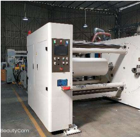
淋膜机 Extrusion Coating Machine