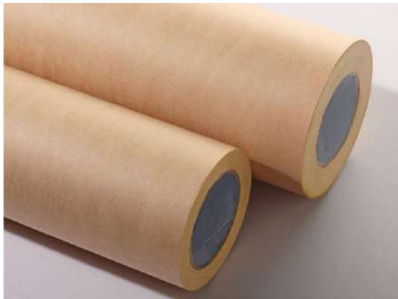
牛皮纸/热胶/黄色格拉辛纸 KRAFT PAPER YELLOW GLASSINE PAPER LINER HOT MELT ADHESIVE