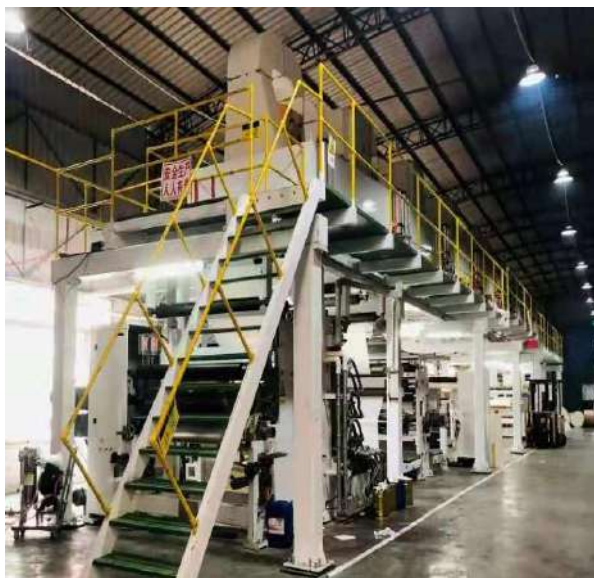
高精度涂硅机1600 Precision Silicone Coating

离型材料解决方案: 单/双面 | Release Material Solutions: Singles/Double Side 适用基材: 纸张/薄膜 (50-300gsm) Substrates: Paper/Film(50-300gsm) 离型力可控范围: 5-200g/in | Release Force: 5-200g/in 耐温性: -40°C~200°C | Temperature Resistance