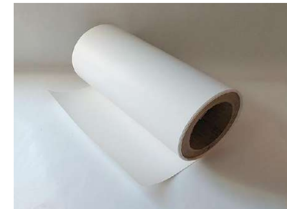
54um合成纸/热胶/白色格拉辛纸 54μm SYNTHETIC PAPER WHITE GLASSINE PAPER LINER HOT MELT ADHESIVE