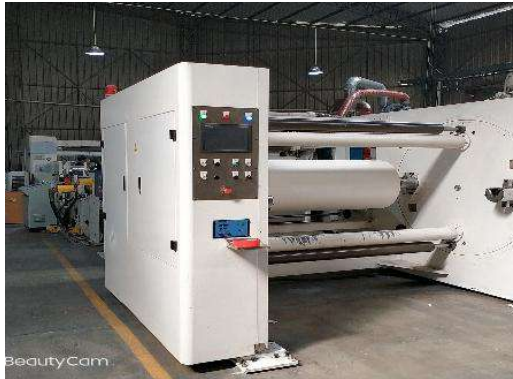
淋膜 PE Coated