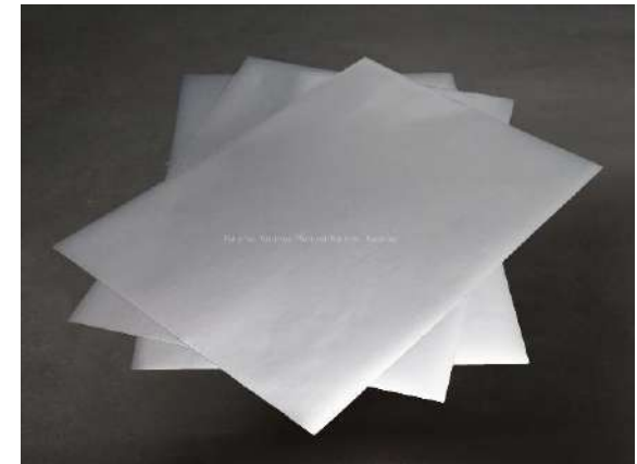
50um哑银/水胶/白色防粘纸 50μm MATT SILVER PAPER WHITE RELEASE PAPER ARCYLIC ADHESIVE