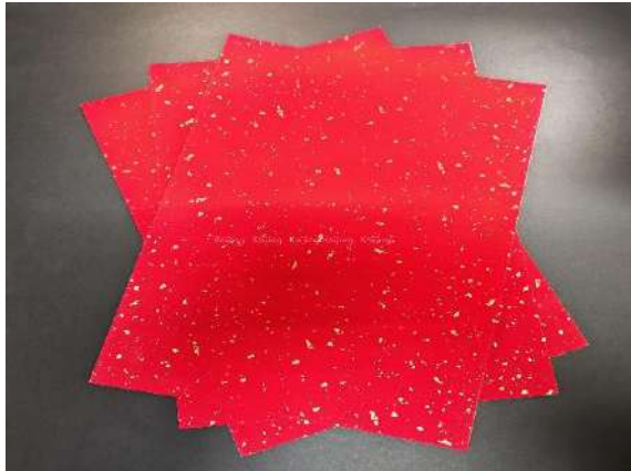
120g洒金纸/热胶/白色防粘纸 120GSM CHINESE XUAN PAPER WHITE RELEASE PAPER HOT MELT ADHESIVE