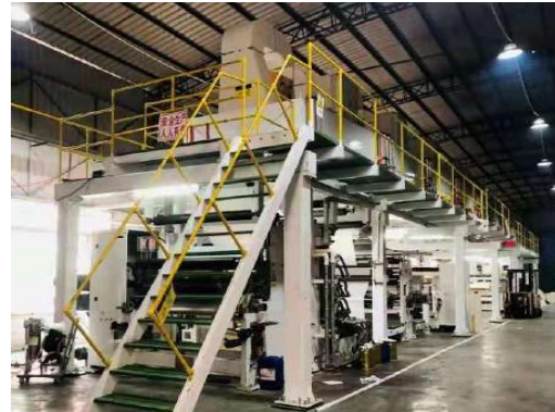
涂硅 Silicone Coated