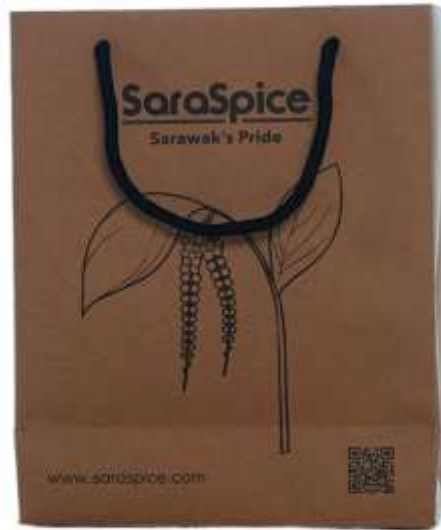
Paper shopping bag