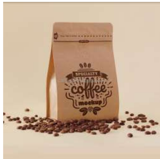
Single-Color logo stock

Plain bags without printing MOQ:2PCS Production lead time:3 days