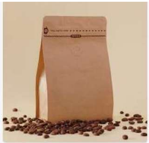
Plain Stock Bags

We offer a variety of different bags for you to choose from.