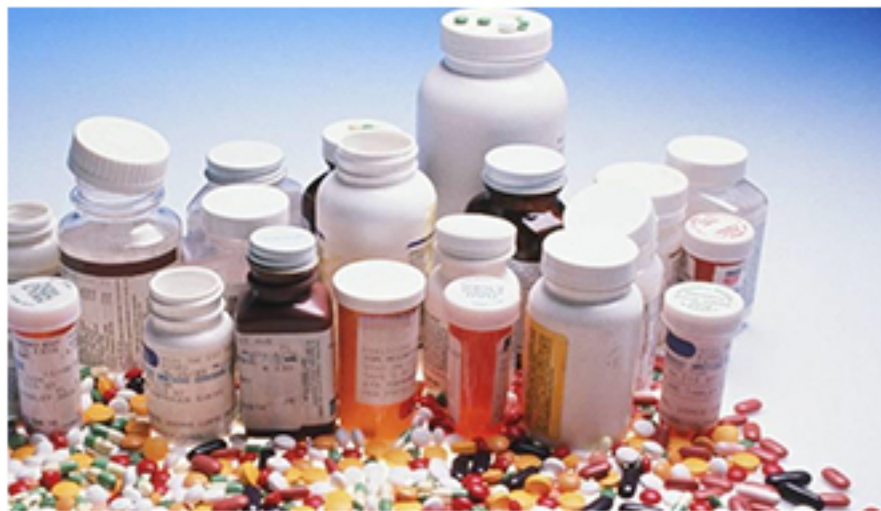
Need to prepare different antibiotics and disinfectants