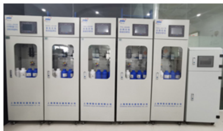
Show Room 2