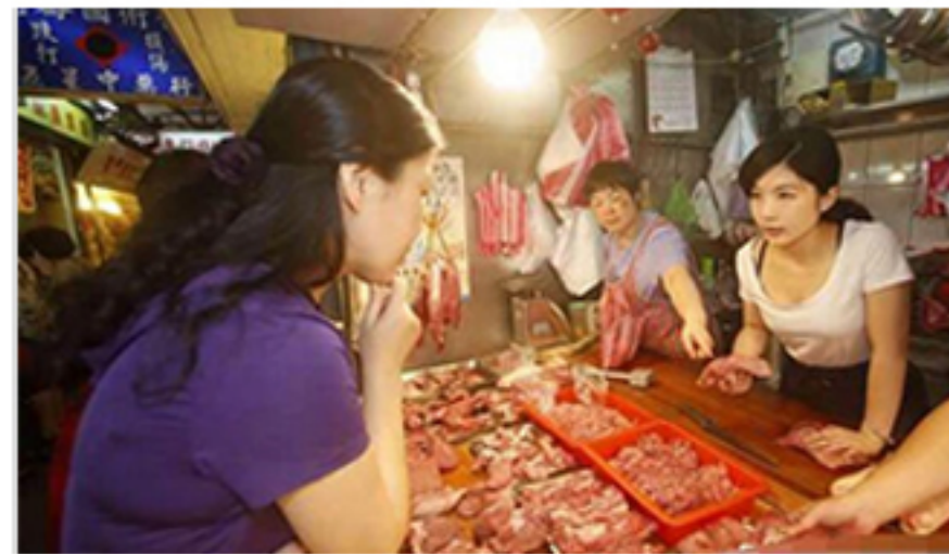
The problem of clenbuterol and Sudan red