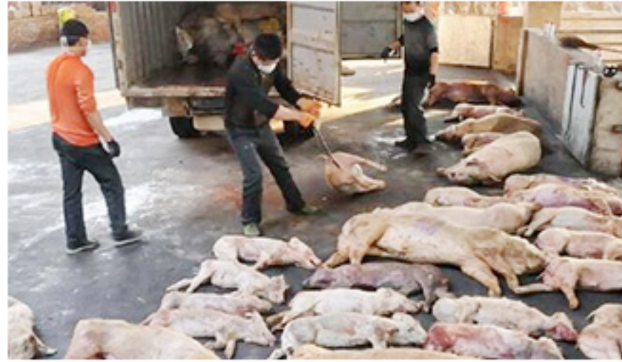
Did not disinfect in time, epidemic was discovered after the occurrence