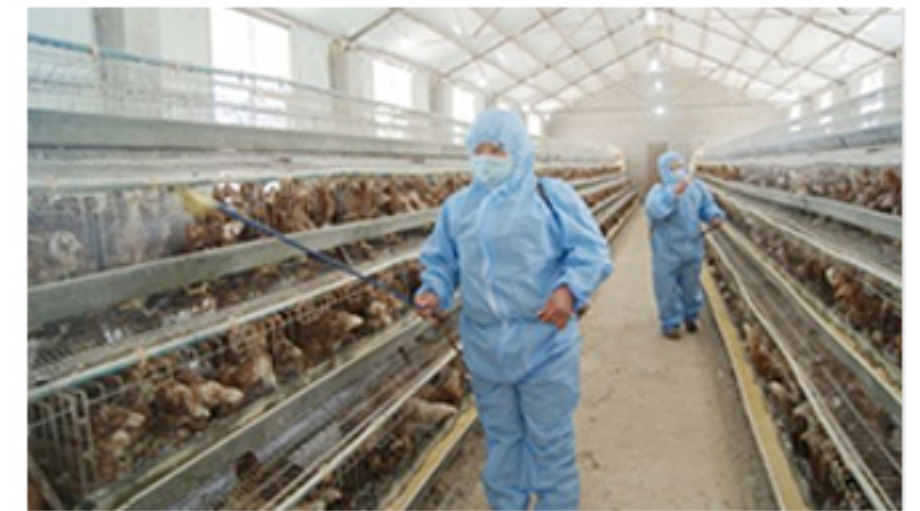
Disinfection link consumes a lot of manpower and material resources