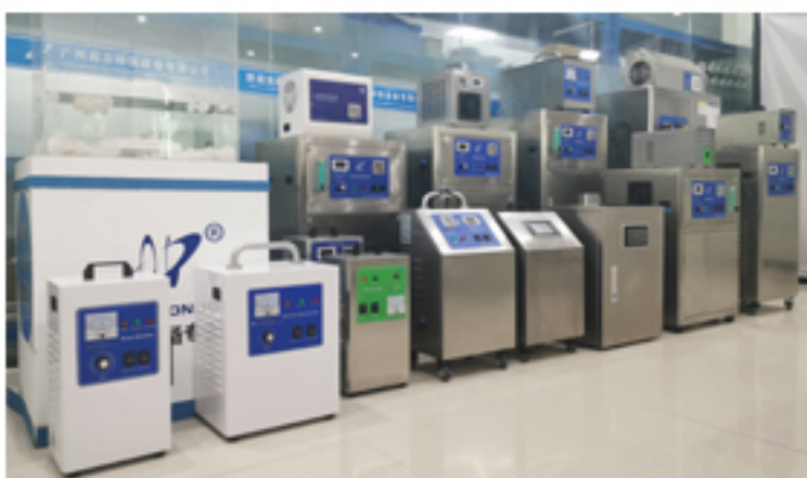
Show Room 1