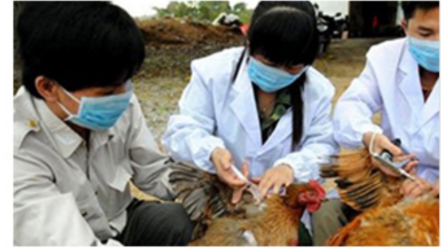
Has been sterilized, but it still produces disease