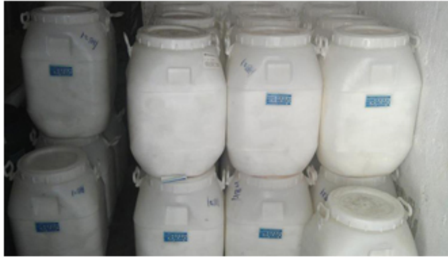
Need to store a large amount of disinfected items

Have you ever encountered this situation when using other disinfection products?