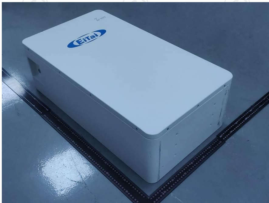
Picture 1. Battery view