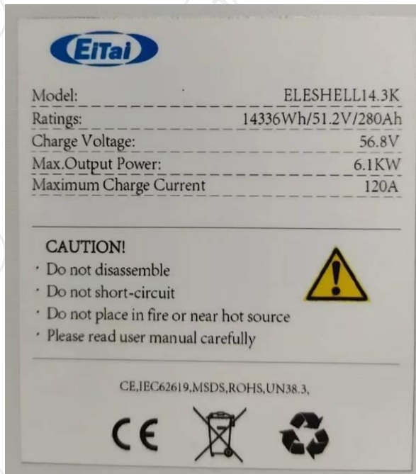
Picture 5. Label view