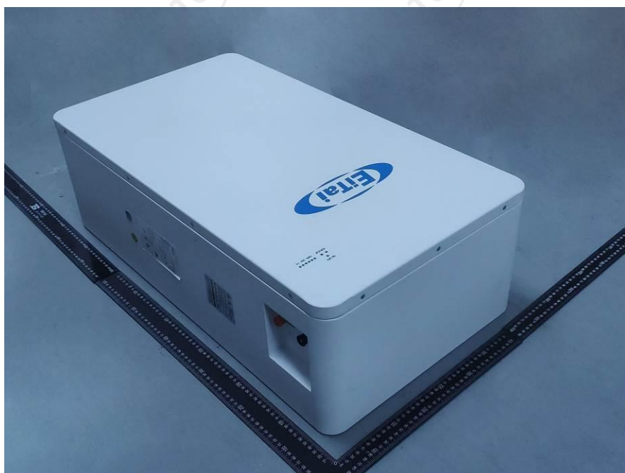
Picture 2. Battery view