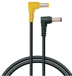
DC5521 male to DC5525 male