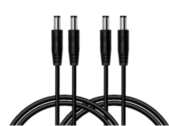
DC5521 male to male x2