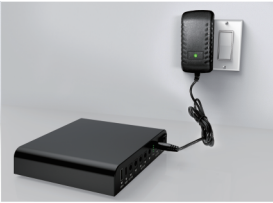
Green-Power bank be full charged.

How to charge other devices(LED light / panel / strip, CCTV, IP CAMERA, AMPLIFIER, etc.)