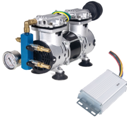
Solar Digital Controller