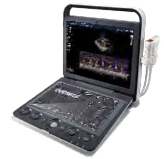
50° Foldable 15" LCD Display Graphical User Interface Touch Screen

SonoScape's S9 offers the highest standard of ergonomics and delivers to you the latest technological innovations with highly-integrated chip sets, which enables excellent portability and flexibility. Incorporated with an intelligent and style-changeable smart touch screen, the S9 has set a new standard for ultrasound scanning, which will bring you unprecedented ease-of-use.