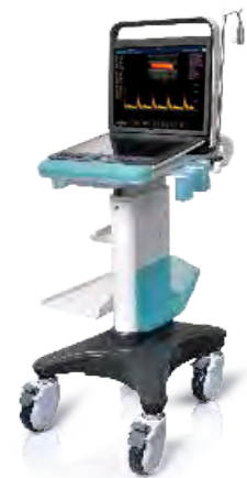
Stylish Trolley with Adjustable Height