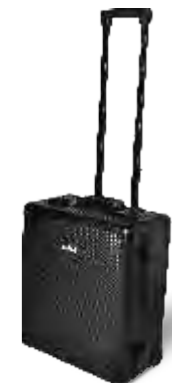
Sturdy Suitcase in Low-pitched Luxurious Style