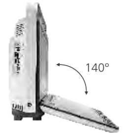
140° Opening Angle Abundant Connection Interface