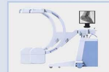
Large forward, backward and swing movement around axis.