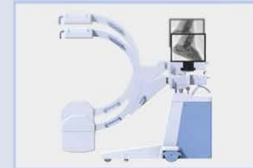
Wide range electric elevating meet different operating tables