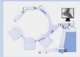
Convenient and reliable C-arm sliding with counter-balance

Unique design of electric auxiliary support arm make the movement of machine more stable.