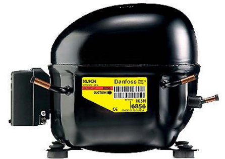
High-performance heavy duty compressor & condenser made in Europe