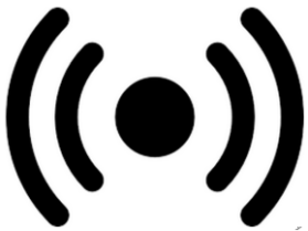
Multi system failure alarms with code display of the failure position