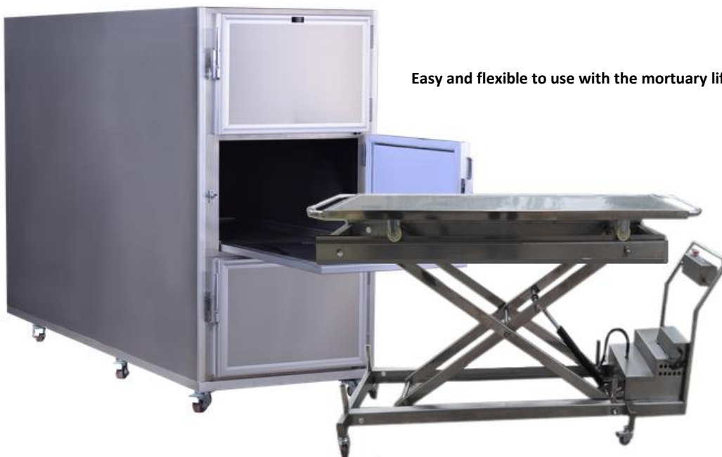
Easy and flexible to use with the mortuary lifter