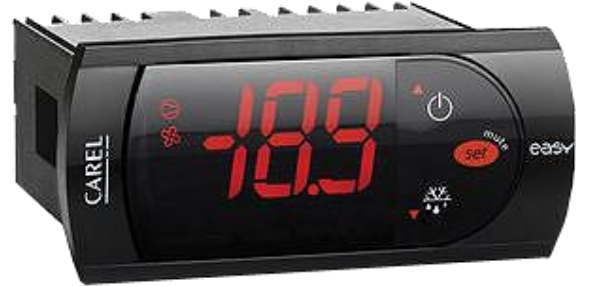
High accuracy computer controlled temperature system made in Italy