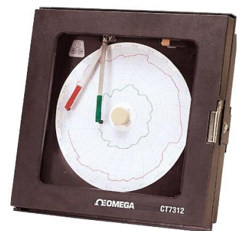
Optional 24 hours tracking, recording & printing system with password protection made in USA