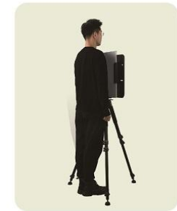
Universal, portable, stable tripod bracket