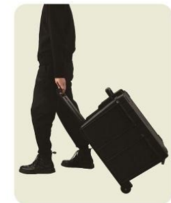
Mobile imaging services