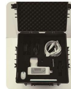
Trolley case, exposure handbrake, battery charger, detector