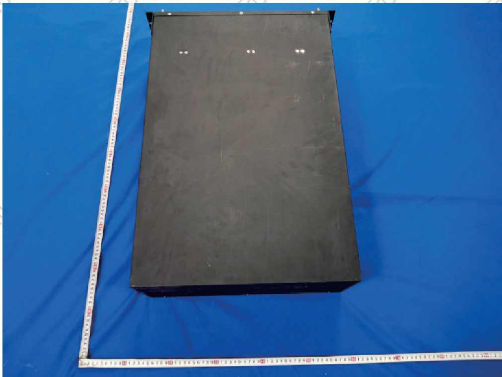
Figure 2 Overall view II of battery (电池外观图II)