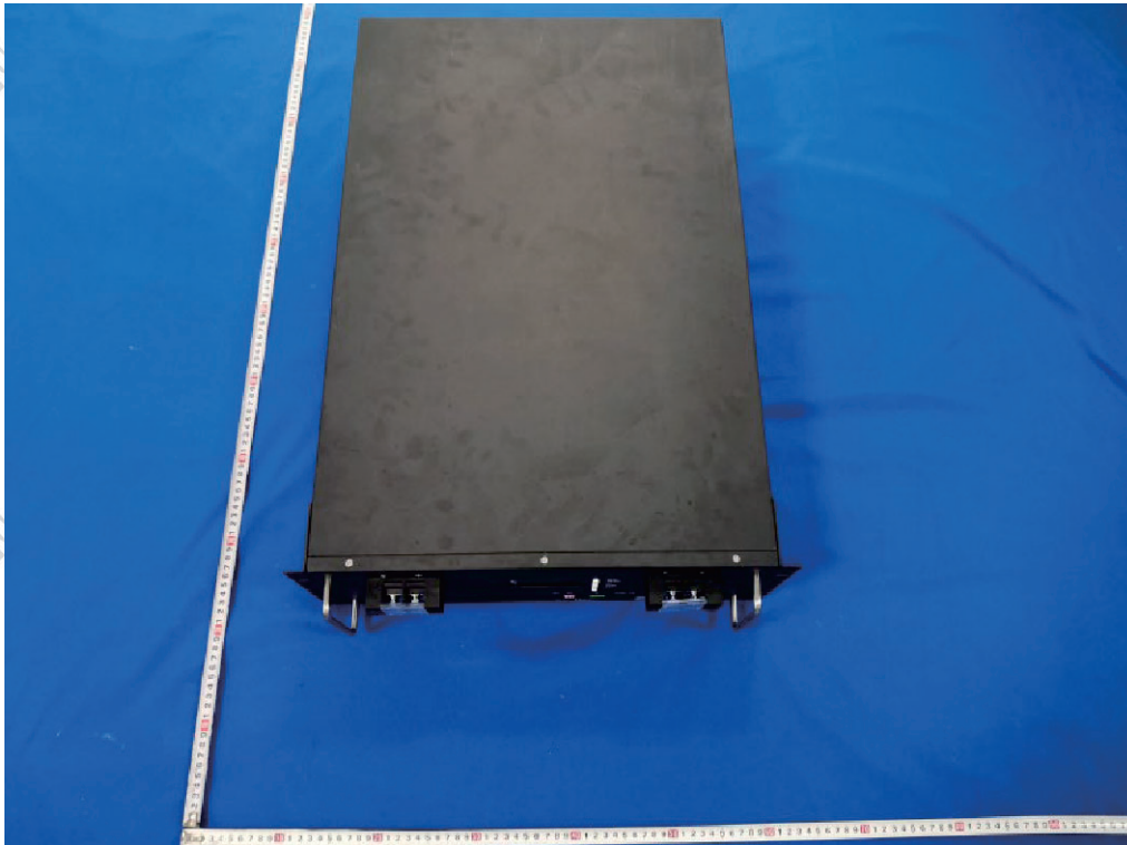
Figure 1 Overall view I of battery (电池外观图I)