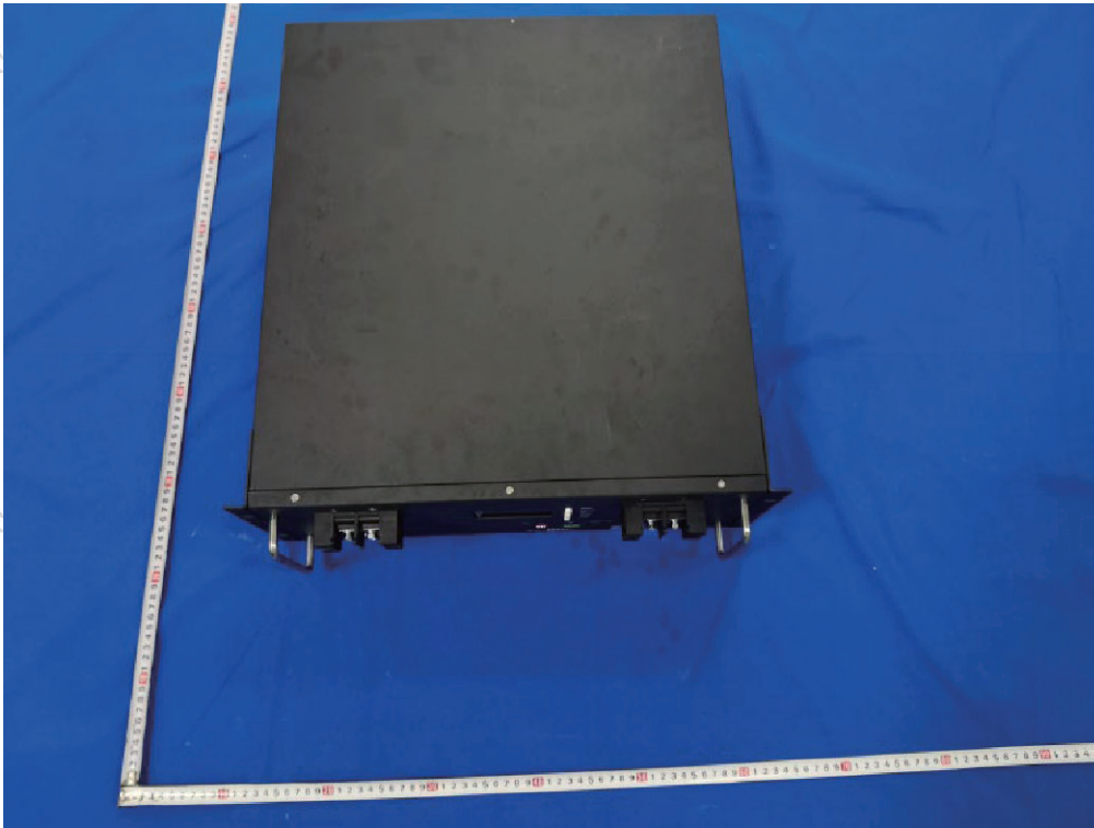
Figure 1 Overall view I of battery (电池外观图I)