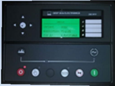
Deepsea 8610 Control Panel

Cummins diesel generator set has many good performances, like toughness, dependability, fuel efficiency. Service, parts, and technical assistance at ports of all around the world. That always is the first choice for customer both home and abroad. The capacity of Cummins diesel generator set has wide spread and power coverage from 200kw to 1500kw. As the largest foreign engine investors of China, Cummins possess Chongqing Cummins Engine Co.,Ltd.( produce M, N, K series engine) and Dongfeng Cummins Engine Co.,Ltd. ( produce B,C,L series engine ) and produce CUMMINS engines with globally uniform quality standard. CUMMINS guarantee the most convenience and shortcut service through their service networks countrywide.