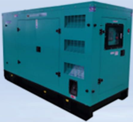
250 KVA GENERATOR

Cummins diesel generator set has many good performances, like toughness, dependability, fuel efficiency. Service, parts, and technical assistance at ports of all around the world. That always is the first choice for customer both home and abroad. The capacity of Cummins diesel generator set has wide spread and power coverage from 200kw to 1500kw. As the largest foreign engine investors of China, Cummins possess Chongqing Cummins Engine Co.,Ltd.( produce M, N, K series engine) and Dongfeng Cummins Engine Co.,Ltd. ( produce B,C,L series engine )and produce CUMMINS engines with globally uniform quality standard. CUMMINS guarantee the most convenience and shortcut service through their service networks countrywide.