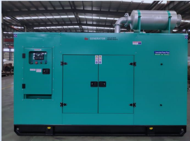
185 KVA Generator

Cummins diesel generator set has many good performances, like toughness, dependability, fuel efficiency. Service, parts, and technical assistance at ports of all around the world. That always is the first choice for customer both home and abroad. The capacity of Cummins diesel generator set has wide spread and power coverage from 200kw to 1500kw. As the largest foreign engine investors of China, Cummins possess Chongqing Cummins Engine Co.,Ltd.( produce M, N, K series engine) and Dongfeng Cummins Engine Co.,Ltd. ( produce B,C,L series engine )and produce CUMMINS engines with globally uniform quality standard. CUMMINS guarantee the most convenience and shortcut service through their service networks countrwvide.