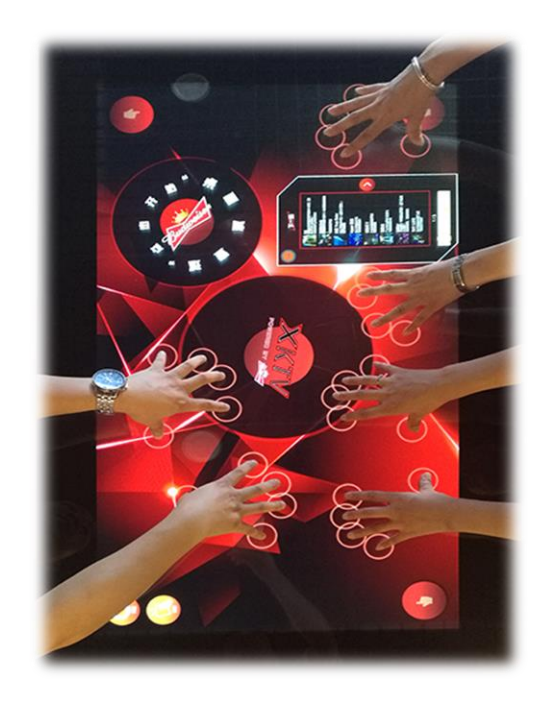
Capacitive | Infrared Tech

SIZE RANGES: 21.5", 32", 43", 49", 55", 65", 75", 86"