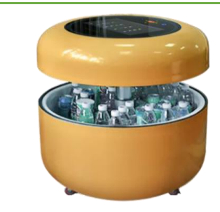
Shape TouchTable Touch Table with refrigerator