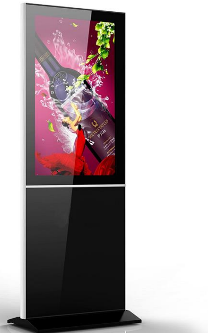
SIZE RANGES: 32", 43", 49", 55", 65", 75", 86"

The screens built in media player will automatically play the content on