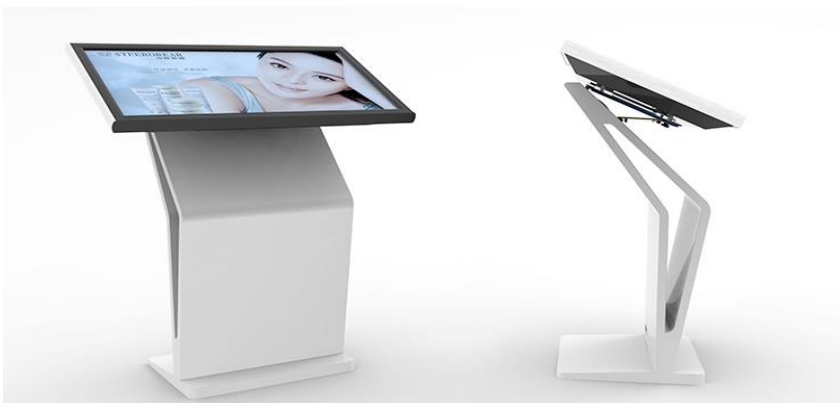
Table Stand | Touch Screen ( Option )

Excellent visual angle, up to 178 degrees.