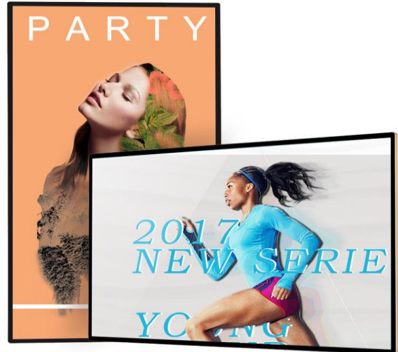
VERTICAL | HORIZONTAL DISPLAY

Each digital advertising display has a built in "Plug and Play" system - simply upload your content onto a USB and insert this into the port on the screen. The screens built in media player will automatically play the content on