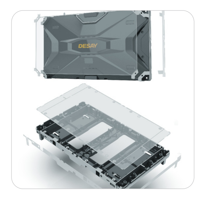
CNC machining for high precision